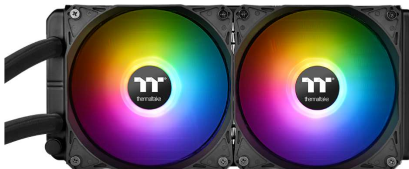
Powerful Cooling Fan