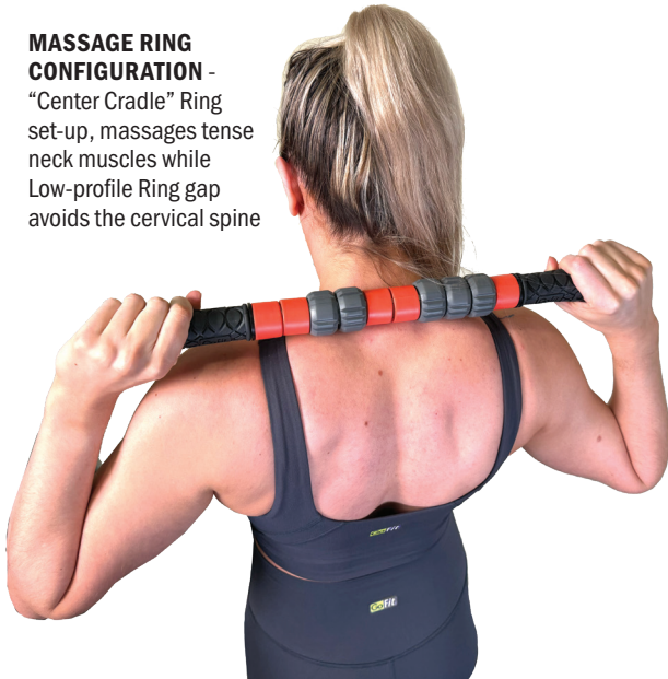
Adaptive Massage Bar

“Center Cradle” Ring set-up, massages tense neck muscles while Low-profile Ring gap avoids the cervical spine