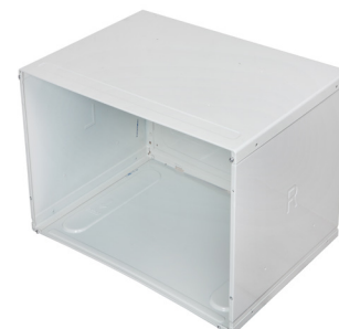
KSTSLV1: Optional Wall Sleeve (Sold Separately)