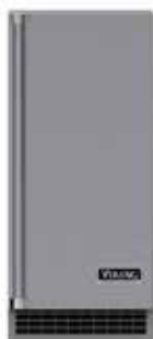
Shown with optional Professional Door Panel