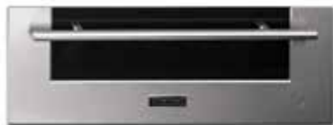
MVWD630SS - Stainless Steel