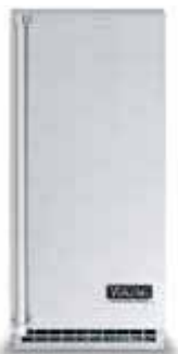
Shown with Professional Door Panel