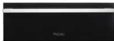
MVWD630BG - All Black Glass