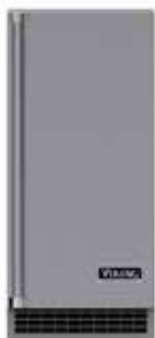
Shown with optional Professional Door Panel