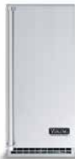
Shown with Professional Door Panel