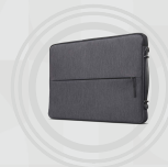
Lenovo Urban Sleeve 14"