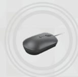
Lenovo 540 USB-C Wired Mouse