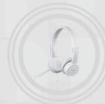
Lenovo 100 Stereo Analog Headset