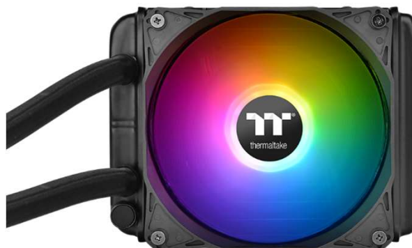
Powerful Cooling Fan