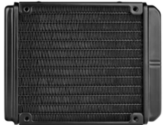
High Efficiency Radiator