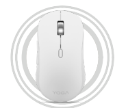
Lenovo Yoga Bluetooth Silent Mouse