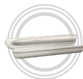
Lenovo Yoga Pen Gen 2 with Case