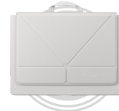
Lenovo Yoga Tote Sleeve