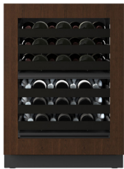
URWD424-IG01A Integrated Frame Glass