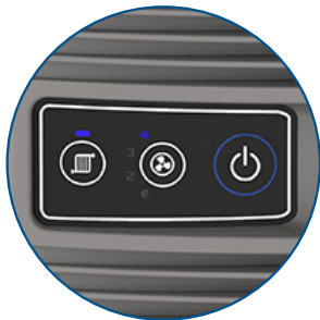
Easy-to-Use Electronic Controls