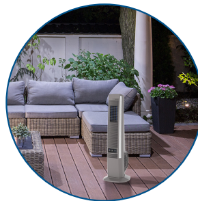
UV Durability and Weather-Resistant Design Blend with Outdoor Decor