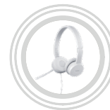
Lenovo 100 Stereo Analog Headset