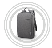
Lenovo 15.6" Casual Backpack B210