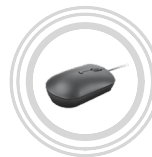
Lenovo 540 USB-C Wired Mouse