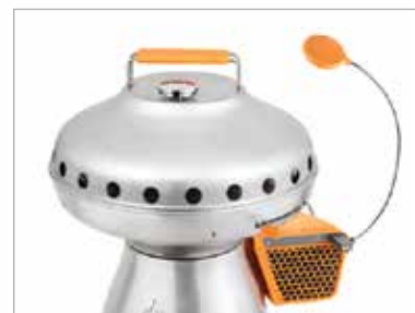
For use with BioLite BaseCamp

When's the last time you had a crispy pizza in the woods? Transform the BaseCamp into a wood-fired oven with this easy-to-use accessory and maximize your backcountry cooking potential.