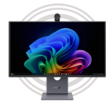
Yoga Pro 27UD-10 Monitor

* Example of Lenovo catalogue naming convention