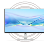
Lenovo L27h-4A Monitor