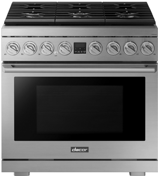
DOP36T86GLS/DA - Silver Stainless, Natural Gas