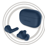
Lenovo TWS YOGA PC Edition