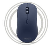
Lenovo Yoga Bluetooth Silent Mouse

* Full headphone functionality requires upcoming software update in Oct 2024. Product images may differ from the latest design.