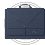
Lenovo Yoga Tote Sleeve