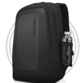
Lenovo 15.6" Laptop Casual Backpack B210