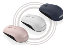
Lenovo 520 Wireless Mouse