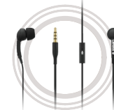
Lenovo 100 In-Ear Headphone