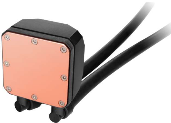
High Performance Water Block