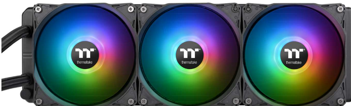
Powerful Cooling Fan